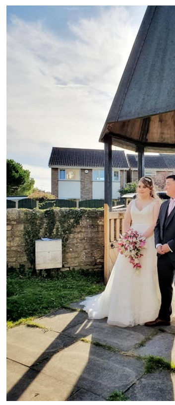
One of our 2019 weddings