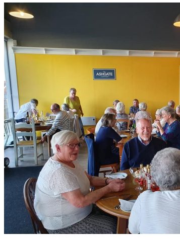
Harvest Supper 2019