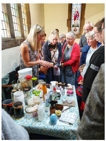
Learning about reducing plastic at Harvest in 2019

Going forward: Since the pandemic we have had to adapt the ways in which we worship and we have seen a great deal of growth not just in personal faith but in new people accessing our worship via many different means both online and over the phone. What I am now calling 'hybrid' worship will be the new norm and I am excited by the possibilities.