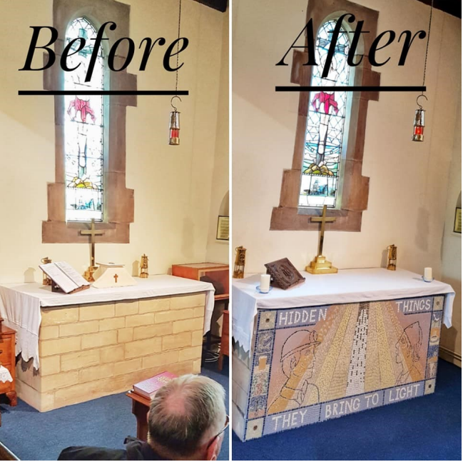
Our new Mining Mosaic