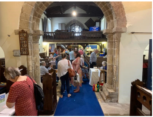
Church full of visitors at the Mining Festival 2019